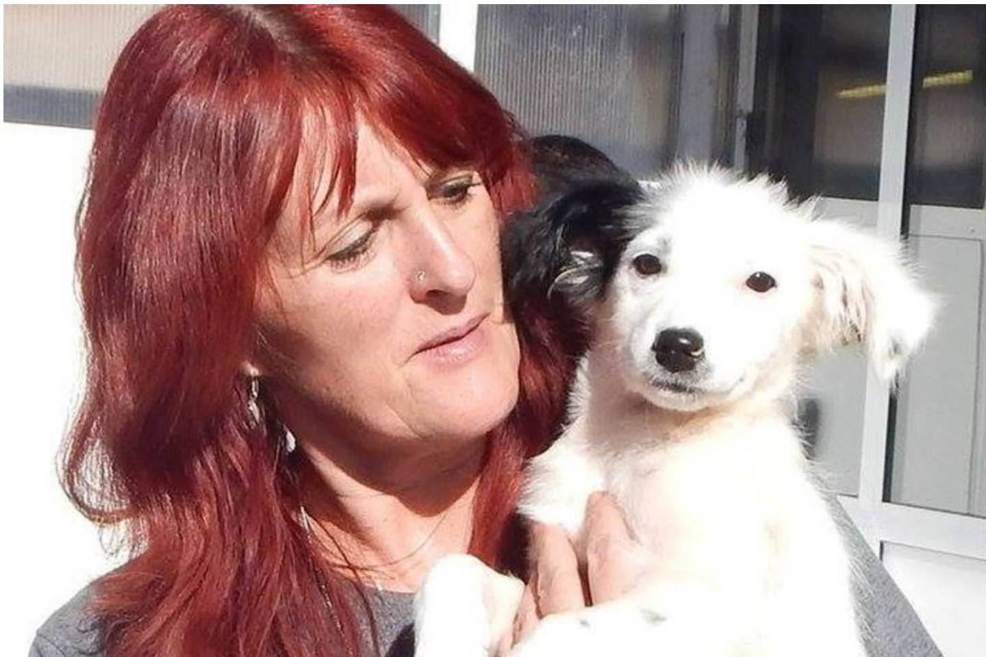
Kind: Diane with a rescued poach

BY PAMELA PATERSON 17:08, 19 FEB 2016 | UPDATED 17:19, 19 FEB 2016