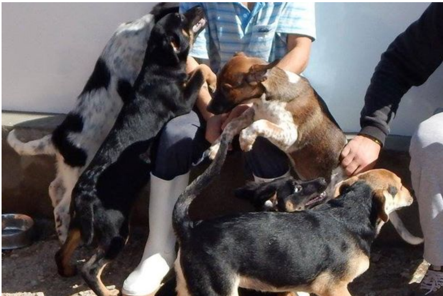
Puppy love: Animal centre is home to more than 200 dogs

The poor animal had been shot, beaten and had part of its skull smashed in.