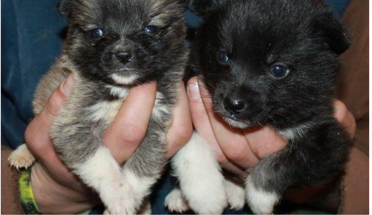
Puppy love: Couple re-home stray dogs

The shelter is home to more than 200 dogs and cats, and the family has taken some time to get used to the culture change in a rural part of the country, near the border with Greece, where there is very little in the way of animal welfare resources.