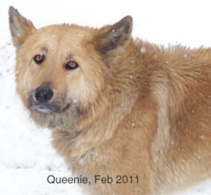
Queenie, Feb 2011

www.streetdogrescue.com streetdogrescue@gmail.com