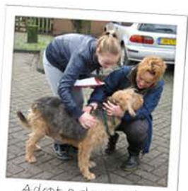
Adopt a dog and give it a new life