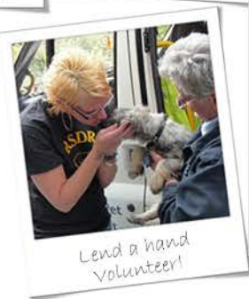
Lend a hand volunteer!