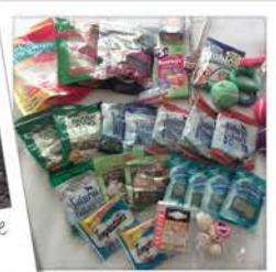
Another care package, gratefully received