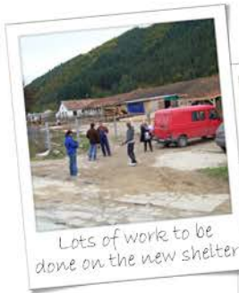
Lots of work to be done on the new shelter

Rudozem Street Dog Rescue is a non-profit foundation that rescues street dogs in Bulgaria and finds them loving homes.