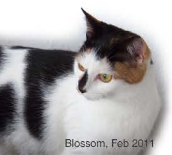
Blossom, Feb 2011

Rudozem Street Dog Rescue Foundation No. 175647065