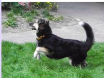
Hope, happy and loved in her new home.

At the beginning of the month, we had to say our sad farewells to Rosie and 16 pups. It is always hard to say goodbye to dogs that we have loved and cared for but we are so grateful to all the new owners, our helpers and supporters for giving these dogs the chance that they deserve. Without our joint efforts, most of these dogs would have died or been killed on the streets.