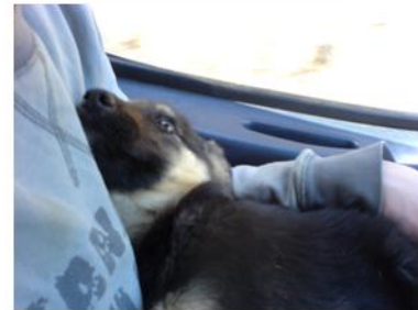
Still in his recuer's arms

Tuffy had wandered near to the landfill and gone in a storm drain which went under the road. After a while, the barking and yelping stopped. We really feared the worse. There was no way of getting into the drains and we were told there were a number of sheer 5 metre drops within them. We still could not give up hoping and searching. On the third day, we heard him barking and Liam (our son) immediately set off in the direction it was coming from. He found Tuffy at the edge of the pipe above the river. This was nearly a 100 metres away from the road. Tuffy was in a very bad way. He was so weak and just collapsed when Liam put him down. We rushed him home and treated him for shock and dehydration. His front leg was dislocated and he was in a lot of pain. Since then he has gained strength and although he still limps, he is now happy and lively. The day after his rescue, the good news came that a lady in Holland wants to adopt him. Tuffy will be going to his home at the end of April.