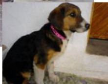
Above. Honey and pups